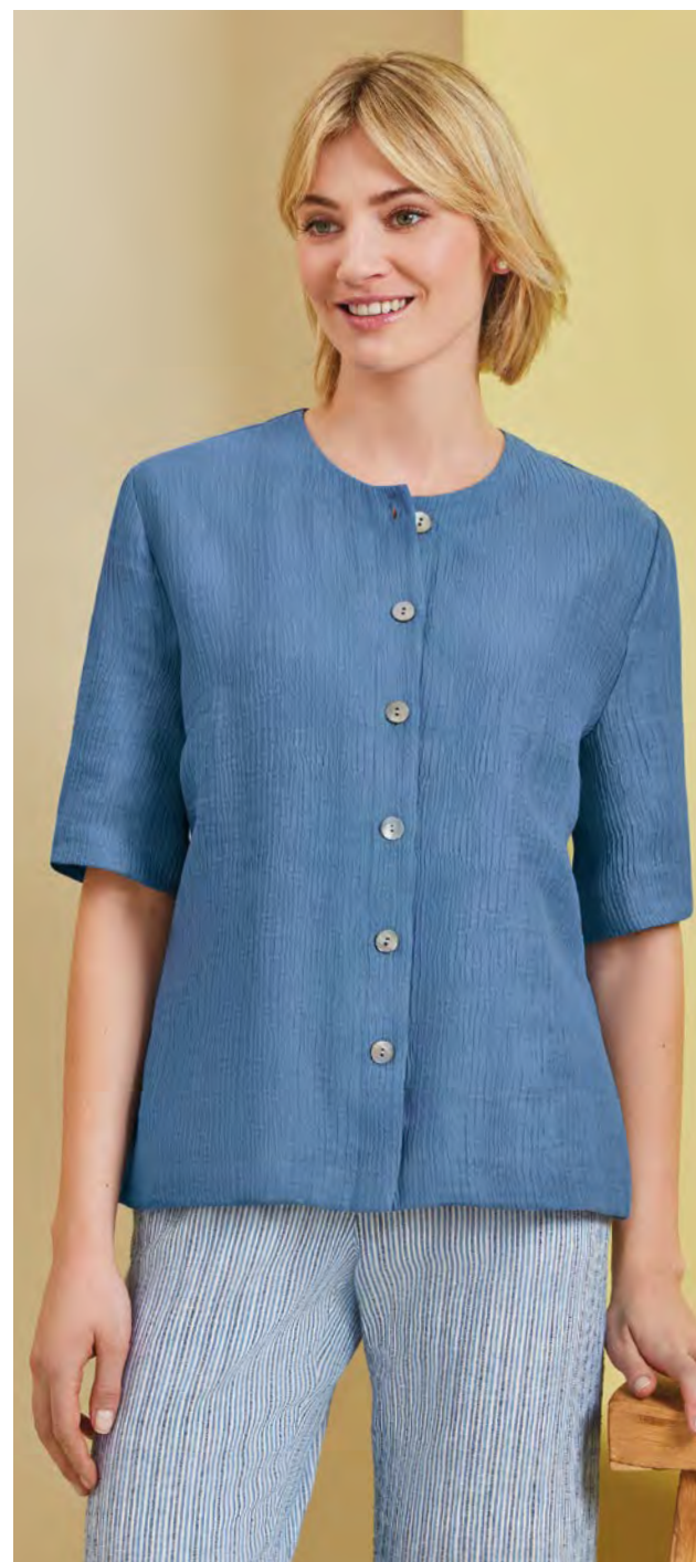
Textured blouse JC308 $145 Made in a soft drapey textured weave fabric, this round neck blouse has bust darts, short sleeves and shell button fastenings. Made in Great Britain. Machine wash cool 45% viscose, 40% lyocell, 15% polyester 4, 6, 8, 10, 12, 14, 16, 18, 20 Length 25" Mid Blue

Comparing USA & UK sizes Please see sizing chart on page 75 for information